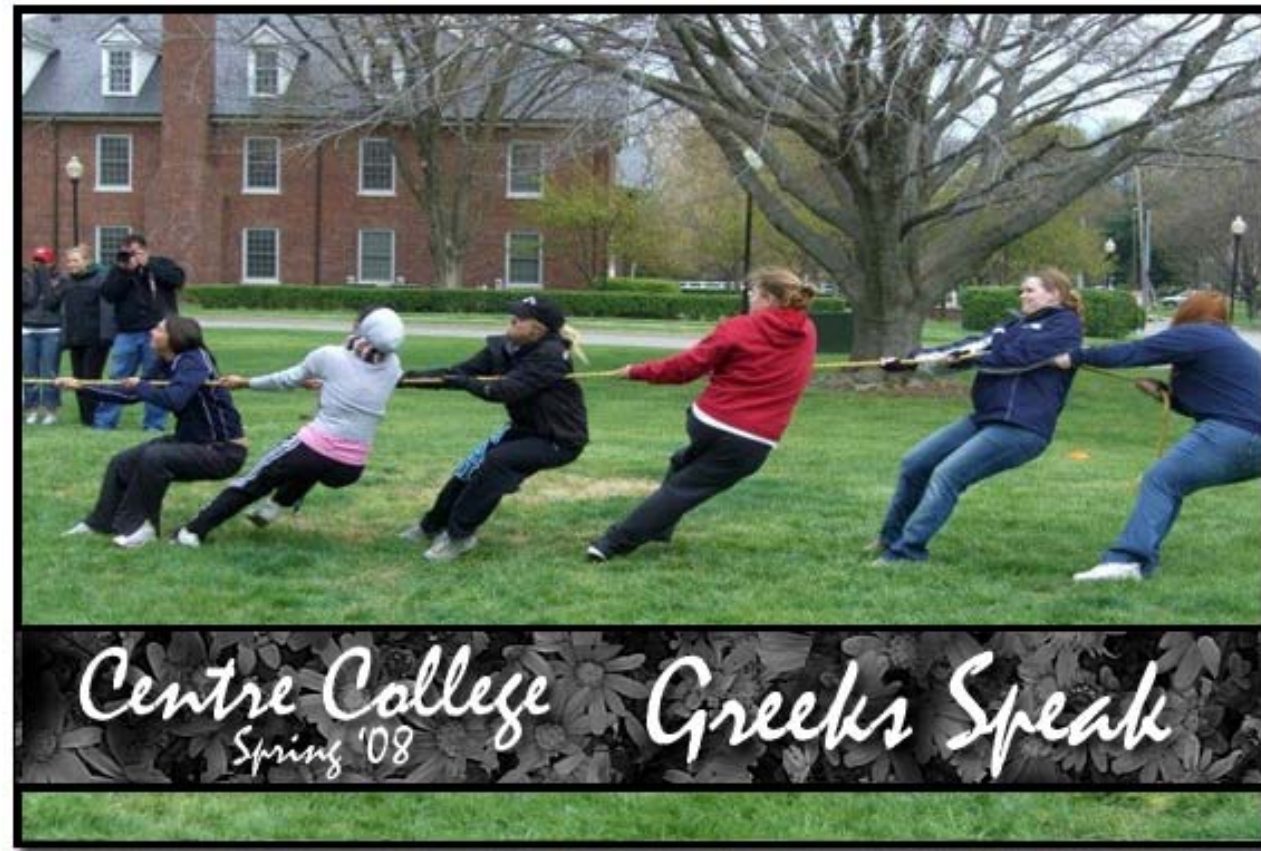
Brought to you by Centre College's Panhellenic and Interfraternity Councils